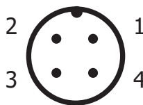
Figure B RPS-429AA-IS Analog Current Output M12 Receptacle Diagram Maximum torque 2 Nm or 18 lbf-in

Pin 1 - Loop - Pin 2 - Loop + Pin 3 - Loop + Pin 4 - Loop -